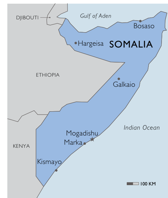
Figure 1. Map of Somalia